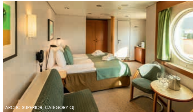
ARCTIC SUPERIOR, CATEGORY QJ

A firm favourite with many seasoned expedition guests, MS Maud has spacious interiors designed in a contemporary Scandinavian style with décor inspired by Norway's nature. You'll enjoy sampling delicious dishes in the trio of outstanding onboard restaurants, while the sauna, outdoor hot tubs, and fitness room will help you recharge. Attend lectures in the lecture hall and demos in the Science Centre, and get to know your fellow guests in the Explorer Lounge & Bar.