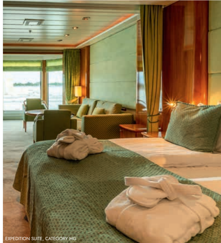
EXPEDITION SUITE, CATEGORY MG